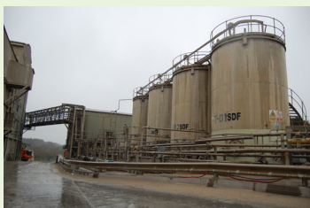
Steetley Dolomite's lime plant faced challenges in burning solvent-derived fuel (SDF) prior to oxygen enrichment.