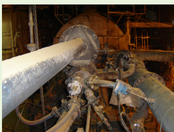
Air Products' engineers designed the oxygen system as an easy retrofit.